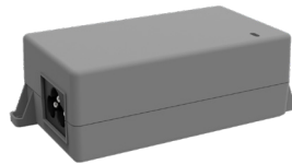
Gigabit PoE Injector (24V, 30W, ~500mA)