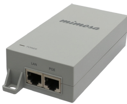
Gigabit PoE Injector (50 V, 60W, 1200mA out)

Mimosa's wide range of Power over Ethernet (PoE) solutions are designed for a clean installation in any environment. Supporting many country specific plugs and power options, Mimosa's PoE is the best power solution for your wireless installations .