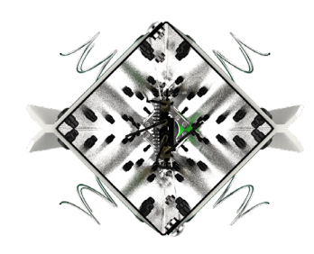
360° Antenna Top Down View