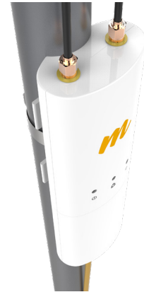
C5c on Pole

**4.9 GHz uses 20 MHz channel widths (U.S. only; Regulations vary by region)